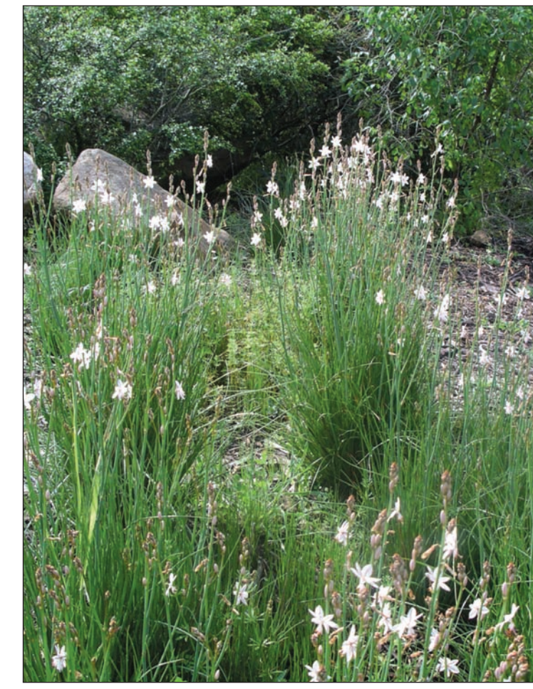
A large patch of Onion Weed, a new invader plant.

So if you are not familiar with this invader, I wanted to share